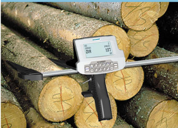
Masser Excaliper II