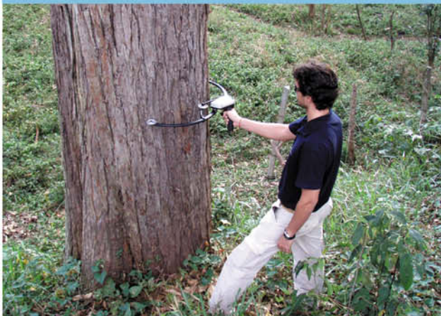
Masser Racal TWC